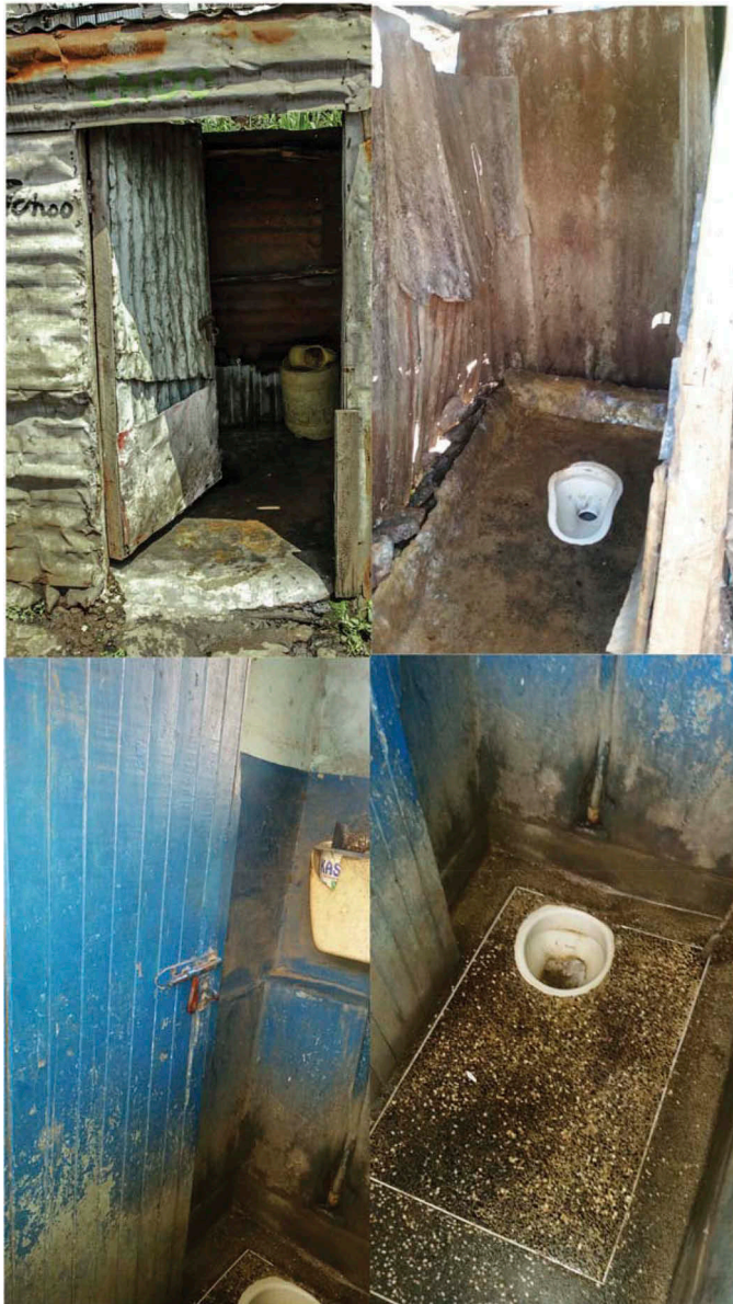
Figure 3. Plot and building toilets. Some women in Mathare share a toilet with several other houses in a building or in a plot.

time of day/night, the conditions, and/or technological characteristics of available sanitation facilities, privacy, and/or the location of sanitation facilities/sites for urination/defecation.