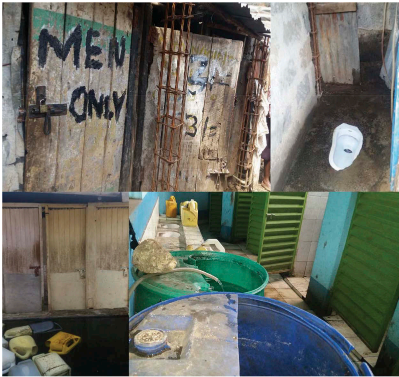
Figure 2. Public toilets. Many women in Mathare rely on public toilets, especially during the day.

common factors influencing their use of those alternatives. Very little additional inclusion/exclusion criteria were used in this study; however, we did require that women were over the age of 18 years, were residents of Mathare (not visitors), were able to give consent, and spoke either English or Swahili.