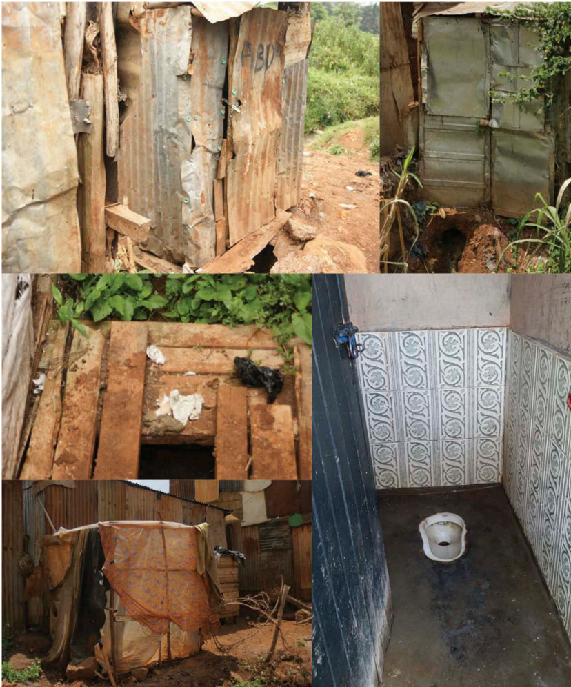
Figure 4. Private and private-shared toilets. Very few women in Mathare have access to a private toilet – used only by one family – or to private-shared toilets – those owned by one family, but shared with other families.

Swahili speakers and familiar with the Mathare context – independently reviewed and coded each woman’s transcripts. Codings were then compared. In instances where researchers’ codes did not agree (approximately 7% of the codes), the full research team discussed discrepancies and agreed upon final codes and resulting findings.