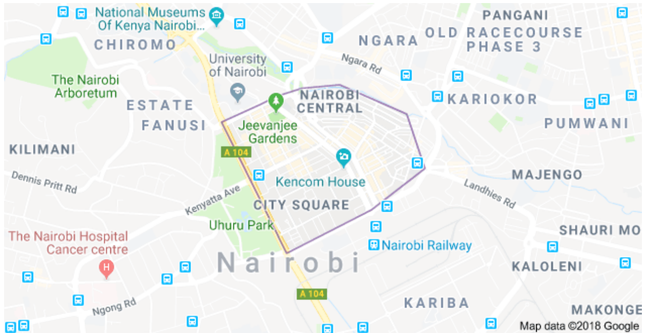
Fig 3.1: A Map of Nairobi Central Business District.