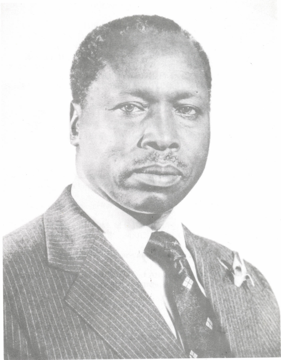
His Excellency the Hon. Daniel T. arap Moi, C.G.H., M.P. HON. LL.D. (NAIROBI), D.Sc. (NEW BRUNSWICK), D.Sc. (MOI), Ed.D. (KENYATTA), D.Sc. Agric. (EGERTON), D.Sc. Eng. (JOMO KENYATTA), Ph.D. (SOKA), Hon. LL.D.(ANDREWS), D.Ed.(BARATON), D.Litt.(MASENO) Chancellor of the University of Nairobi and President of the Republic of Kenya and Commander-in-Chief of the Armed Forces.