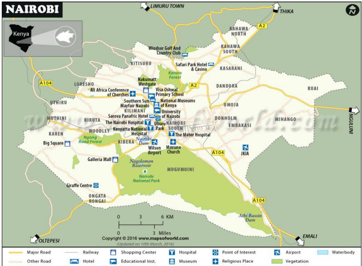
Figure 4.1: Map of Nairobi showing the five sites selected for tomato sampling