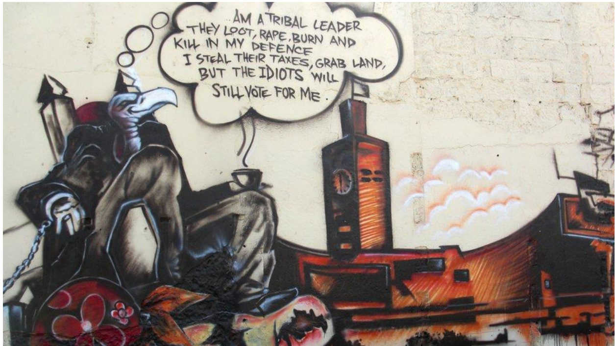
Fig 3.2: Graffiti depicting Kenyan leaders as vultures.

MPs(Erenrich & Wergin, Grassroots Leadership and the Arts for Social Change, 2017). The Ma Vulture movement used graffiti as an element for conducting civic education.