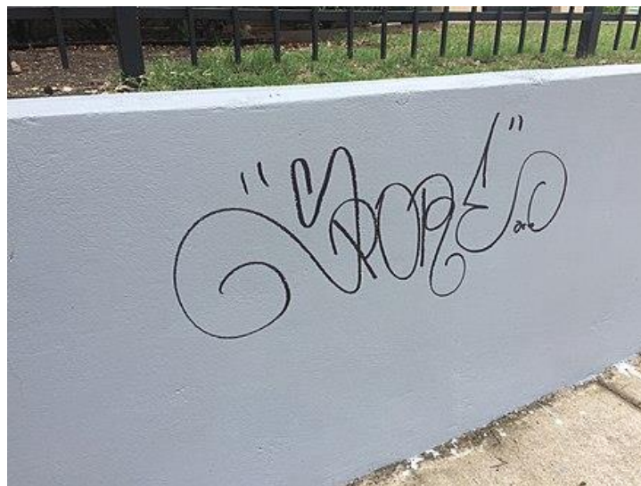
Fig 2.2: A tag.

Graffiti are symbols, drawings or writings that have been painted, scribbled or scratched onto walls or other surfaces and are often within public view(Gottlieb, 2008). There are several forms of urban graffiti, however four predominant forms exist. Tags are the most basic form and are artists' signatures composed of one colour(See Fig 2.2).