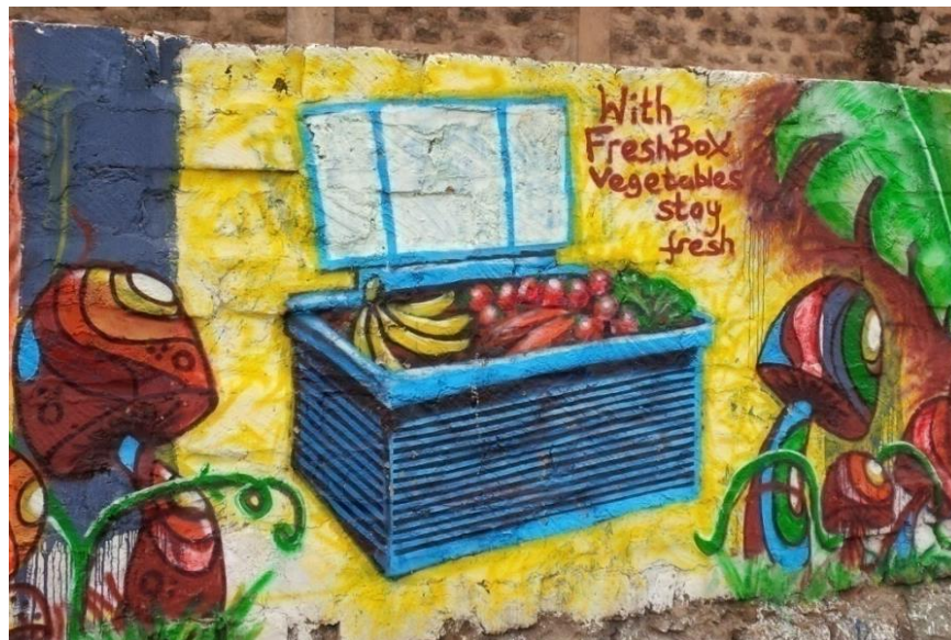
Commercial Graffiti 1 - 5:01:2019 - Kibera

These graffiti usually aim to promote a product or service. They are mostly commissioned and done on high traffic areas.