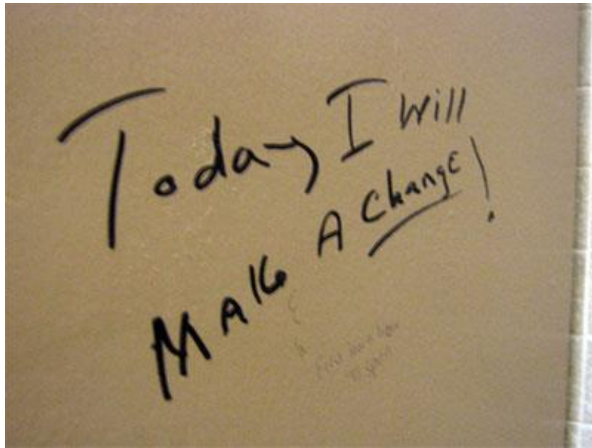
Fig 2.7: Immediate graffiti in a washroom.

They usually occur unplanned as the artist impulsively gets an idea and puts it on a surface. Graffiti art is a more common form of graffiti. It is more artistic and much thought goes into the creation process. They are commonly referred to as murals (Lannert, 2015).