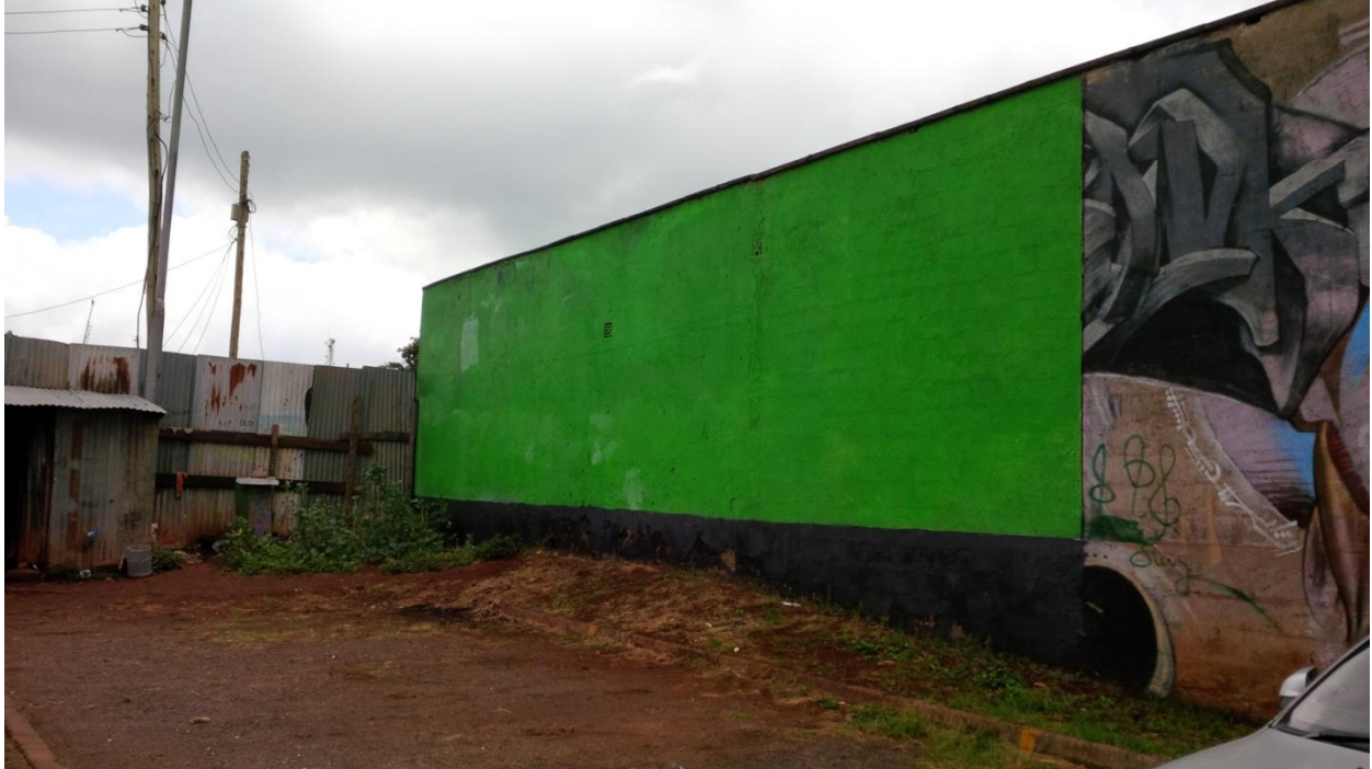
Fig 4.1: Graffiti painted over (The area painted green used to have graffiti) 5-01-2019