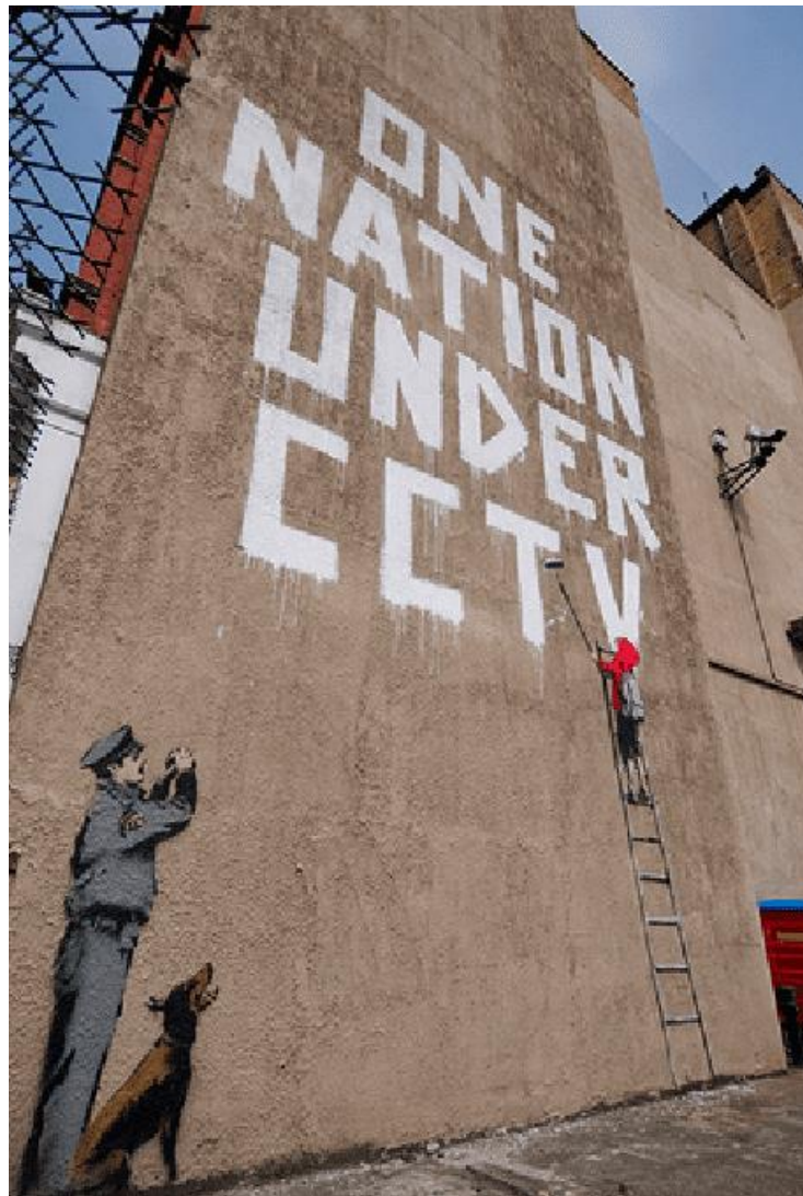
Fig 3.1: One Nation Under CCTV.

In 2007, Banksy created a piece titled One Nation Under CCTV. The piece shows a child in a red jumper at the bottom right corner painting the phrase 'One Nation Under CCTV' while a policeman and a dog watch from the bottom left corner. (See Fig 3.1).