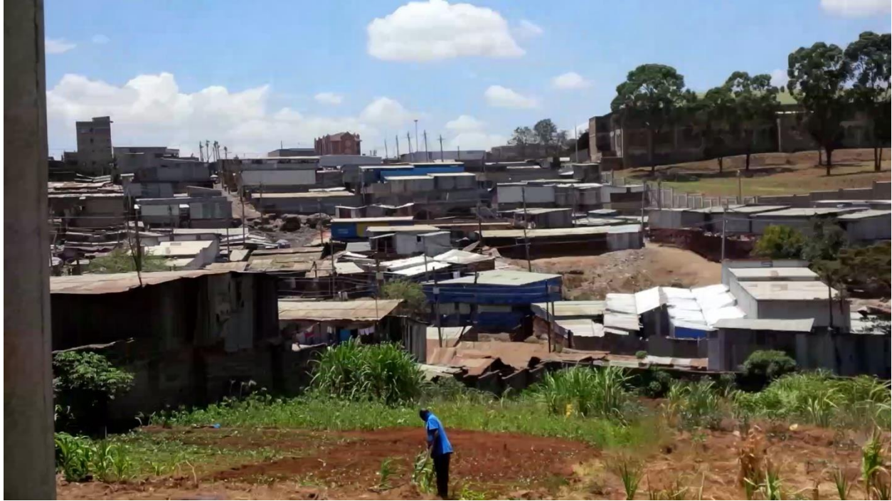
Fig 4.3: A view of Part of Mathare(15-02-2019)

A total of 18 residents were sampled and interviewed. The table below shows the results (See Table 3.8 ).