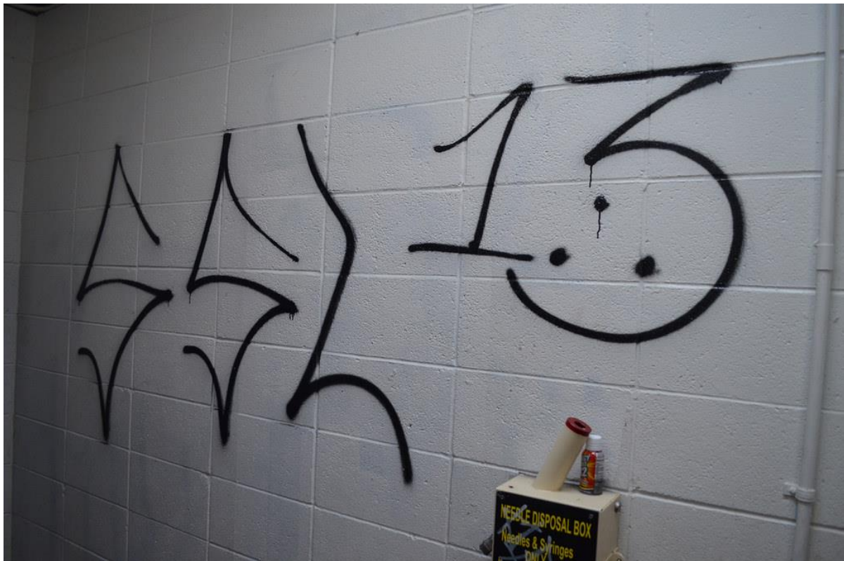
Fig 2.6: Gang Graffiti (South Side Locos 13 Gang).

Broader categories of graffiti exist around the world. Gang graffiti is graffiti that represents a specific gang while also indicating the artist’s gang affiliation. This type of graffiti usually employs symbols and colors related to the gang in question. It is mainly used to communicate to gang members and rival gangs (See Fig 2.6).