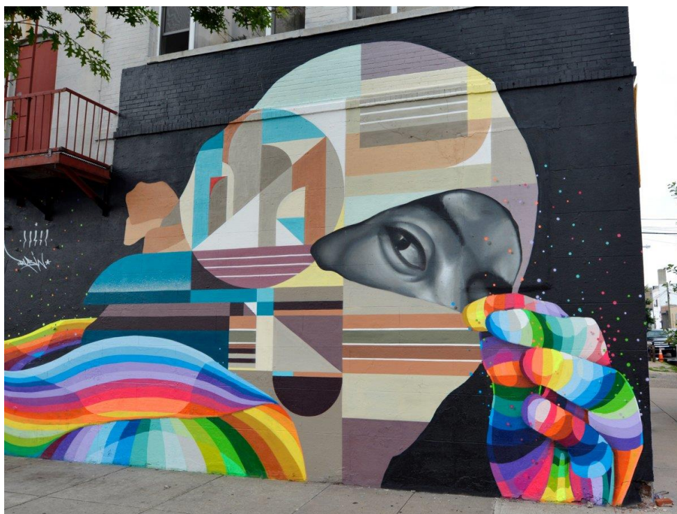
Fig 2.8: Street Art.

Street art is still considered illegal unless it is commissioned (Lannert, 2015).