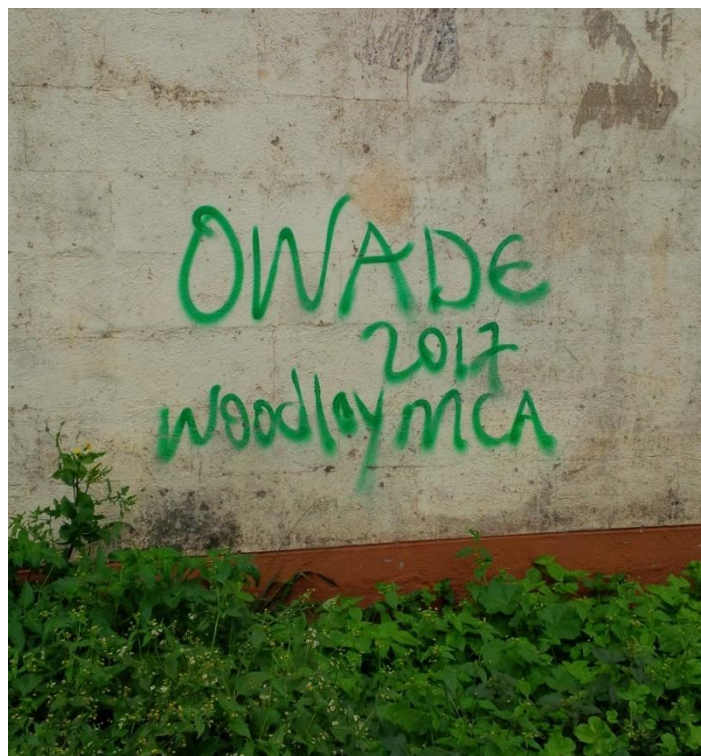
Political Graffiti 1 - 5:01:2019 - Kibera

These carry political messages and increased in number during political seasons. They are mostly used to communicate campaign slogans and to urge residents to vote for a particular candidate.