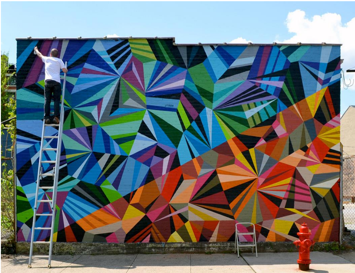
Fig 2.5: A Graffiti Mural.

Murals are the most advanced form of graffiti (See Fig 2.5). They usually cover whole walls and incorporate several colors and effects (Martinez, 2009).