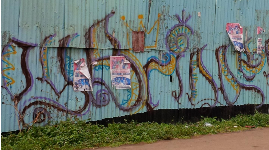
Destructive Graffiti 2 – 5:01:2019 – Kibera