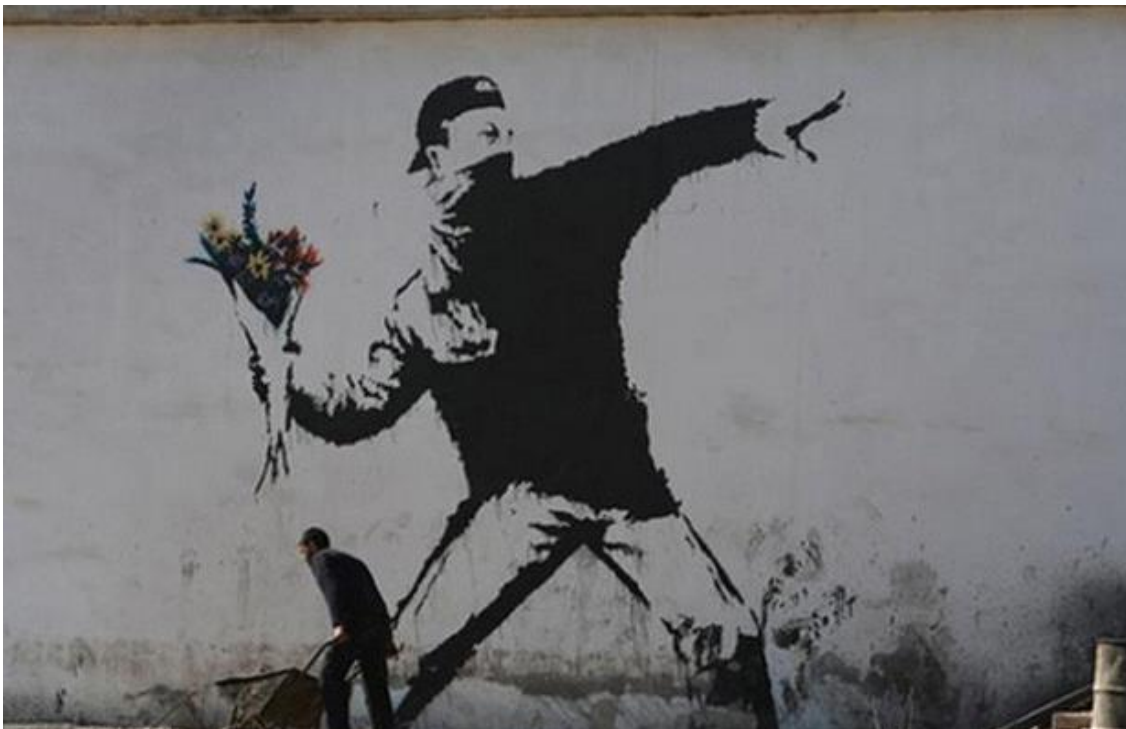
Fig 2.9: Rage, the Flower Thrower.

In 2005, a graffiti artist by the name Banksy produced a piece titled Rage, the Flower Thrower . In this work, a man dressed up in riot gear with a bandana hiding his face and his cap facing backwards is depicted. The stance he appears in is similar to that of a person who is about to throw a petrol bomb. Instead of the petrol bomb, he is seen holding a bunch of flowers. The bunch of flowers is the only colored part of this work (See Fig 2.9 ). Banksy uses this piece to spread the message of peace in an area known for conflict. The graffiti is located on a wall in Jerusalem on the main road to Beit Sahour in Bethlehem (Duncan, 2018).