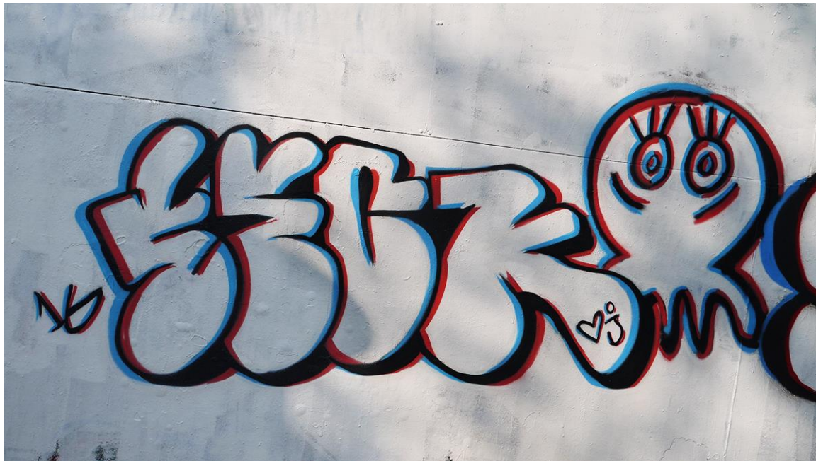
Fig 2.3: A Throw-up.

Throw-ups come after tags and are more advanced. They consist of one colour outline and one colour fill (See Fig 2.3).