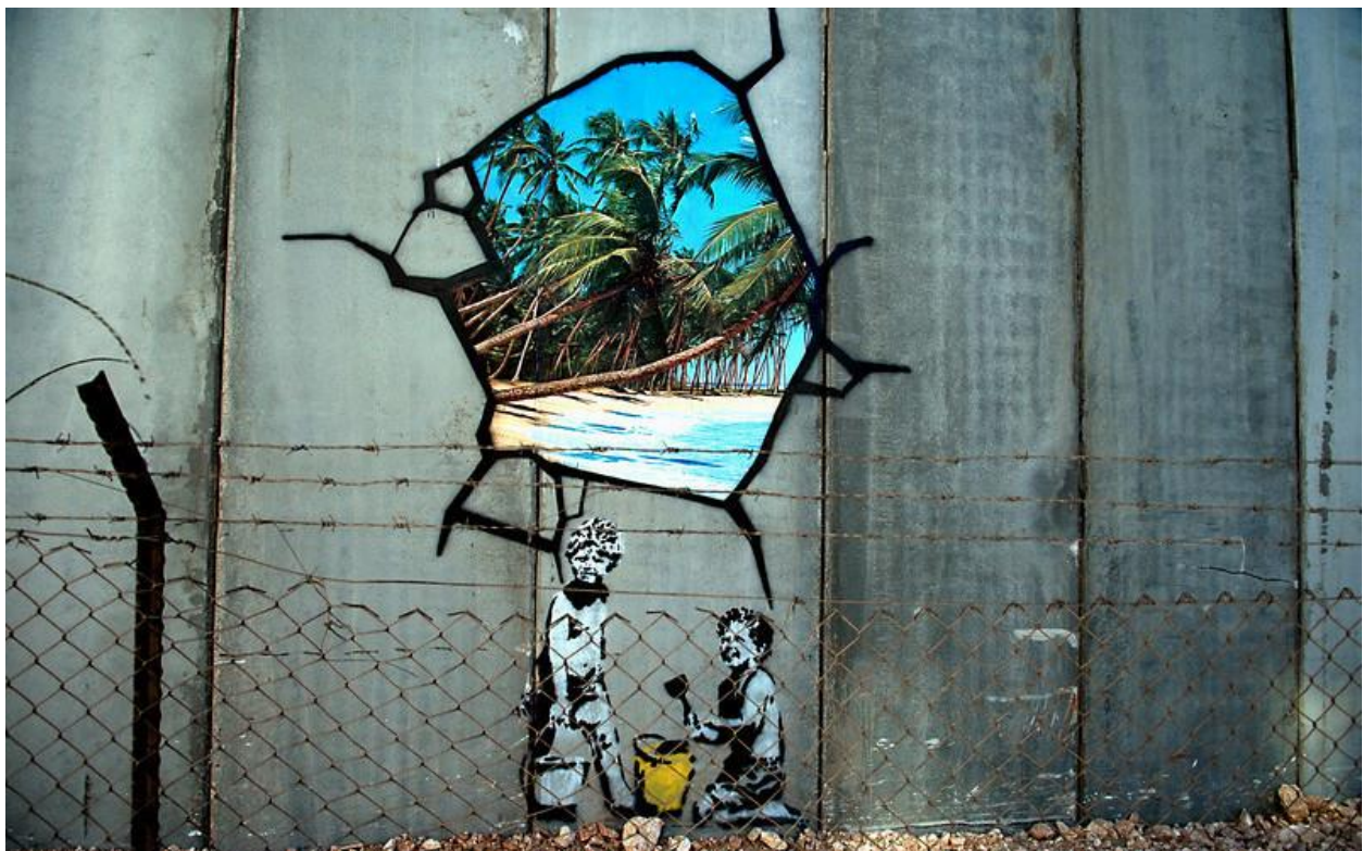
Fig 3.0: Unwelcome Intervention.

Through this artwork, the artist attempts to imply that a better political environment may only exist once the wall is brought down. The wall separates the Israelis from the Palestinians and while the Israelis see the wall as protection against terrorism, the Palestinians feel that it is a tool for racial segregation. The artist also tries to bring to the viewer's attention the toll that the conflict takes on the innocent by using children in his work (Duncan, 2018).