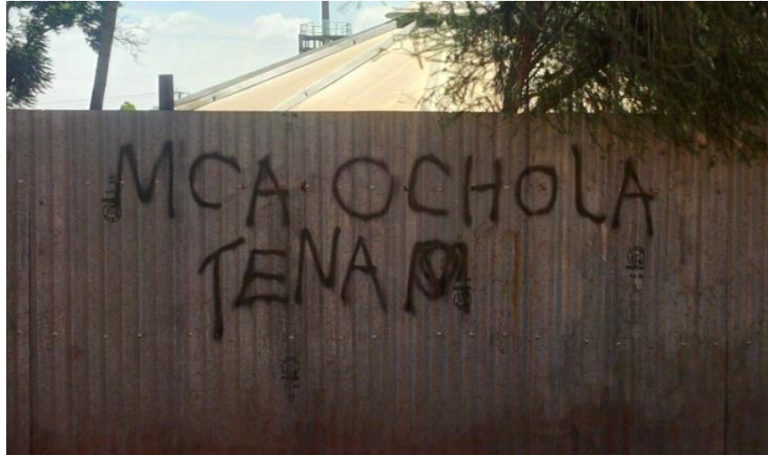
Political Graffiti 2 - 15:02:2019 - Mathare