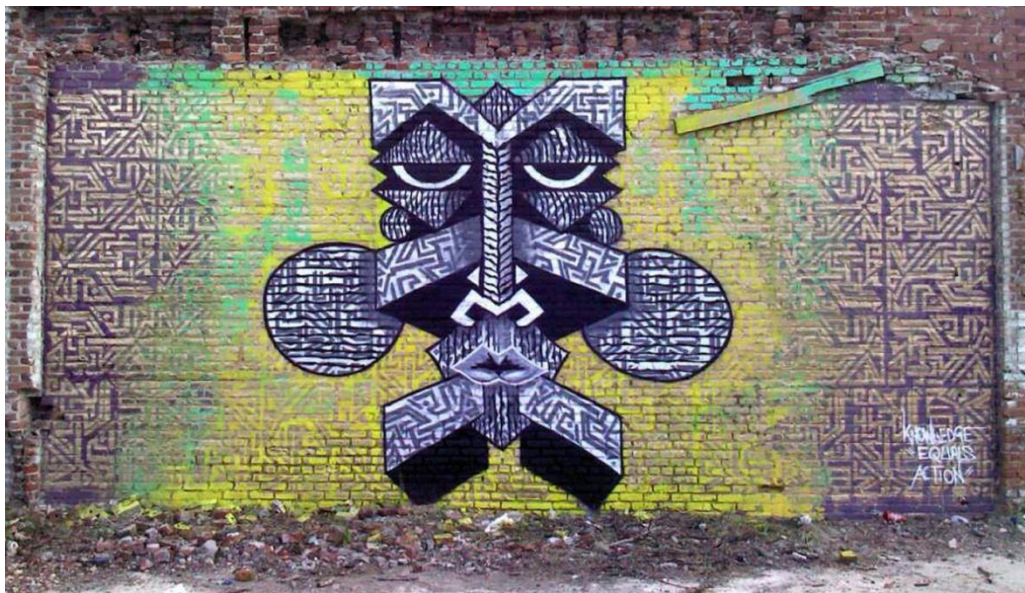
Fig 2.4: Graffiti Piece.

Pieces come after throw-ups and are more complex and advanced. They are usually three dimensional and incorporate several colors as well as effects (See Fig 2.4).