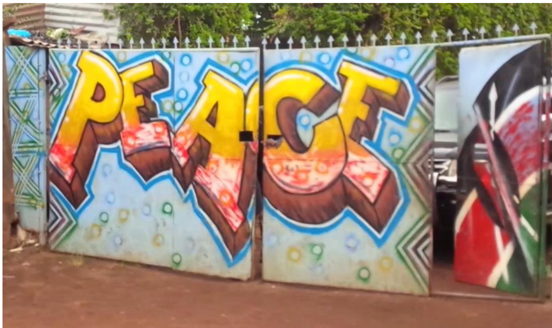
Inspirational Graffiti 1 - 5:01:2019 - Kibera

These graffiti usually created to encourage positivity. They usually contain positive messages or could even be created to brighten dull spaces.