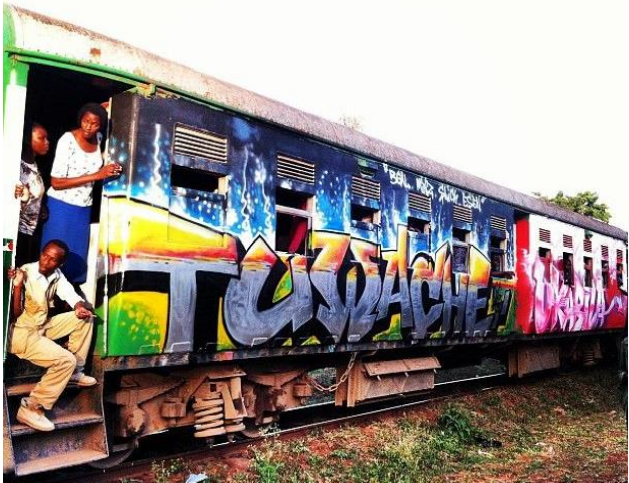
Fig 3.3: Peace Train Project.