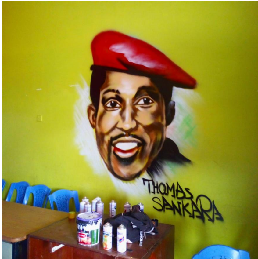
Fig 4.5: Commissioned Thomas Sankara Portrait