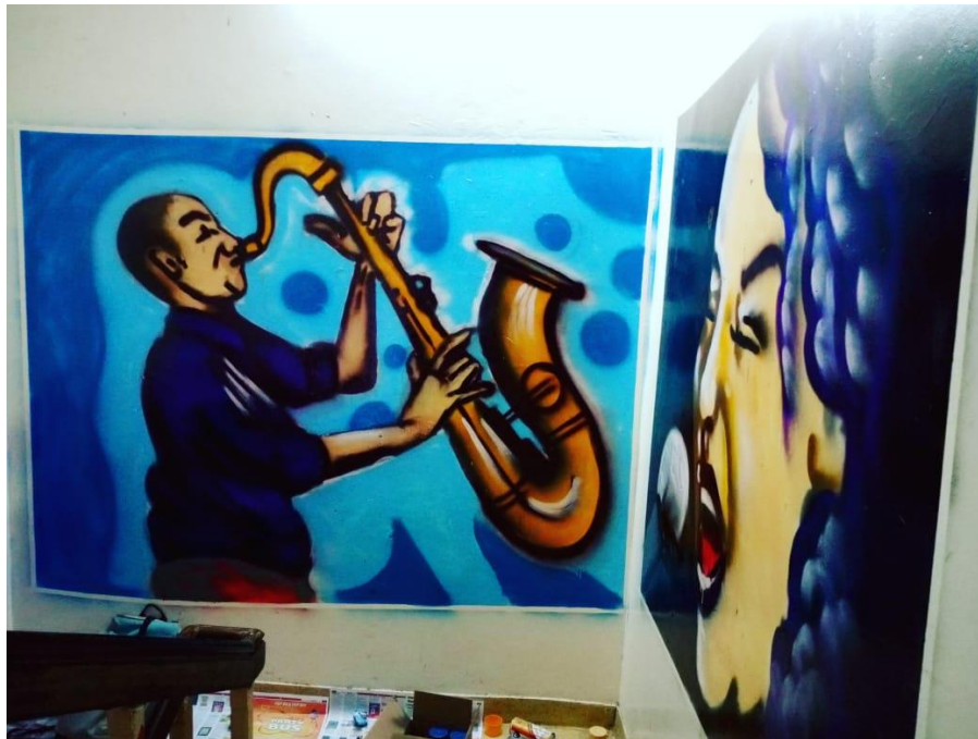
Fig 4.6: Commissioned Art to bring Life to the Space