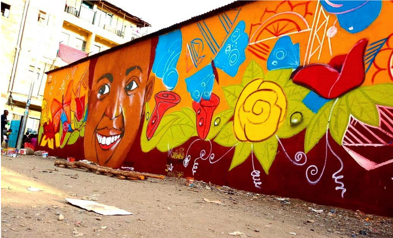
Fig 4.4: Mural on a Wall to Brighten the Area

Below are some of Mutua’s graffiti (See Fig 4.4 –Fig4.6).