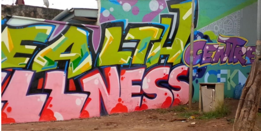
Commercial Graffiti 2 - 5:01:2019 – Kibera