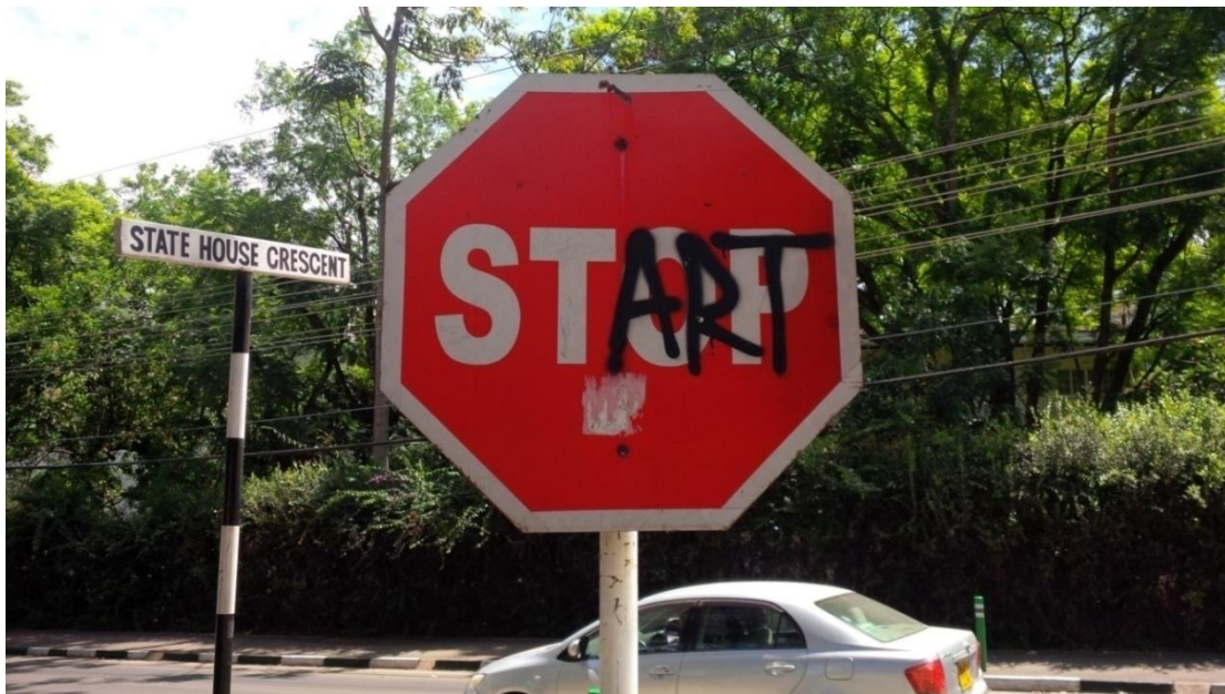
Destructive Graffiti 1 - 7:02:2019 – Nairobi CBD

These graffiti deface property without passing any purposeful message.