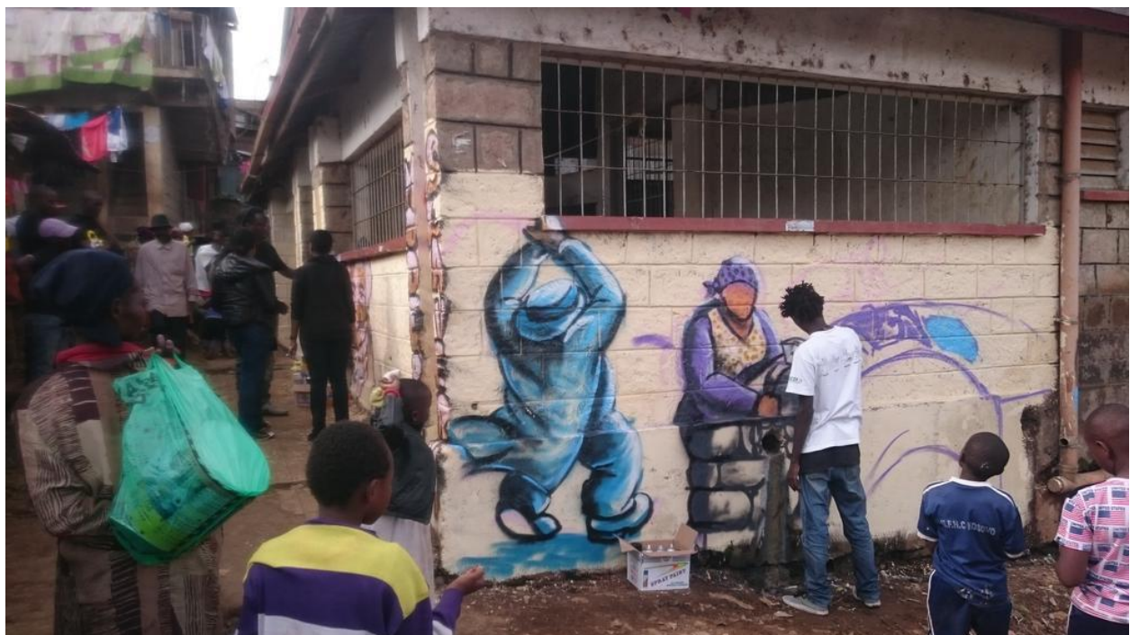
Fig 3.5: HAART Kenya anti-trafficking graffiti.