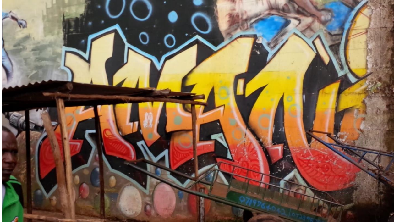
Inspirational Graffiti 2 - 5:01:2019 – Kibera