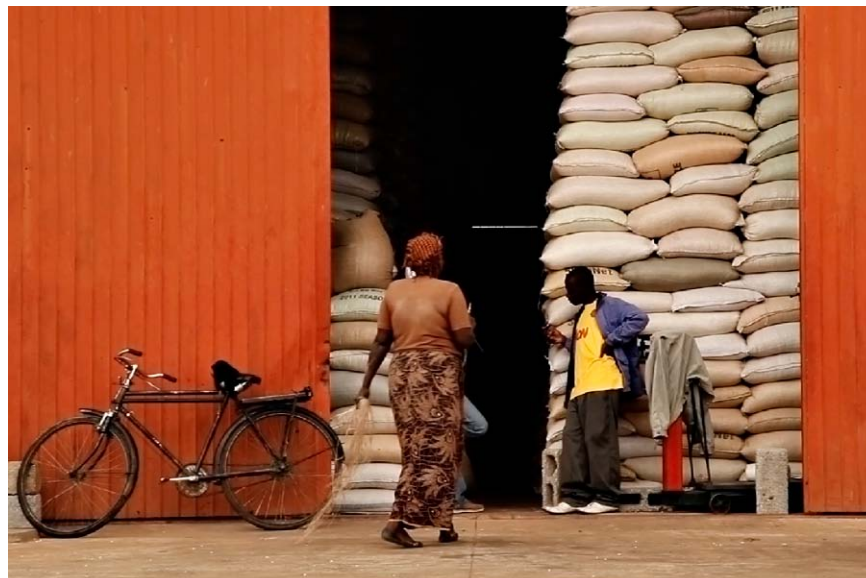
Zambia grain store: agriculture in Sub-Saharan Africa is growing and continues to receive political attention but the challenges to achieving food security and sustainable rural livelihoods persist.