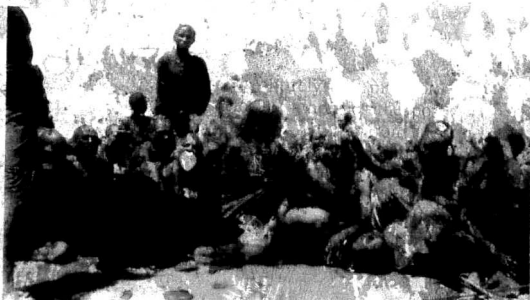
Turkana in Baraza