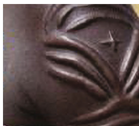
FIGURE 2: Tattooing marks shown by one of the adolescent blood donors in Homa Bay county.