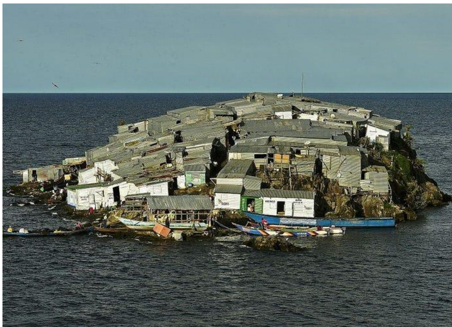
Figure 1.6.4 Migingo Island surrounded by valuable fishing areas

countries. The disputes have been attributed to the errors made by the colonial governments in drawing the boundaries, unclear and unmarked boundaries, lack and/or weak border management, population bulge and bad governance. 40 One such conflict is the Kenya-Uganda dispute over ownership of Migingo Island in Lake Victoria. Migingo Island has an area of 0.49 acre but is surrounded by waters extremely rich in fisheries resources. Diplomatic means were employed to prevent the conflict from escalating to a violent confrontation between Kenya and Uganda. The two countries agreed to survey and demarcate the boundaries so as to determine whether the Island is in Kenya or Uganda. During the survey, the demarcation line attributed the Island to Kenya but both Kenya and Uganda authorities are co-managing the Migingo Island.