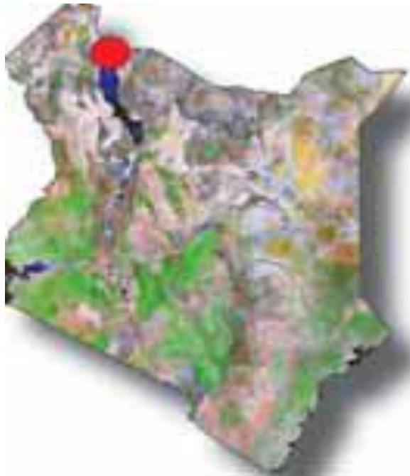
Figure 1.7.1: Kenya’s map indicating the Location of Omo Delta

Todonyang Location is the northernmost administrative unit of Turkana County. The area is characterized by resource-based conflicts, and cross-border cattle rustling.