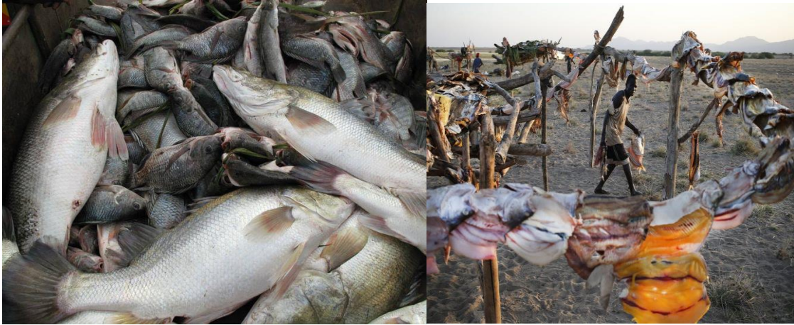
Figure 3.2.2: A photo of a Species rich fish catch at the Omo delta and sun drying of fish at Todonyang Fishing Village in Turkana. The fish species are threatened with extinction if the water level continues to drop

Livelihoods and food security were also affected due to decreased fish catches. Past research findings by scientists from KMFRI also noted that the decline in fish landings in Lake Turkana was associated with drops in water level. 63 For instance, analysis of the fish landings in relation to the building and filling of the dam showed that the total annual fish production was nearly 4,700 MT worth about Kshs. 90 Million in 2006. The fish production then rose to 9,000 MT worth Kshs. 300 Million in 2009. However, the fish catches took a nose dive in 2012 to about 3,000 MT valued at Kshs. 240 Million. The fish catches then increased again in 2015 to nearly 10,000 MT worth Kshs.700 Million. However the fish production plummeted from 10,000 MT to about 4,300 MT in 2016. A summary of the annual fish catches and the water levels are as shown in the table: