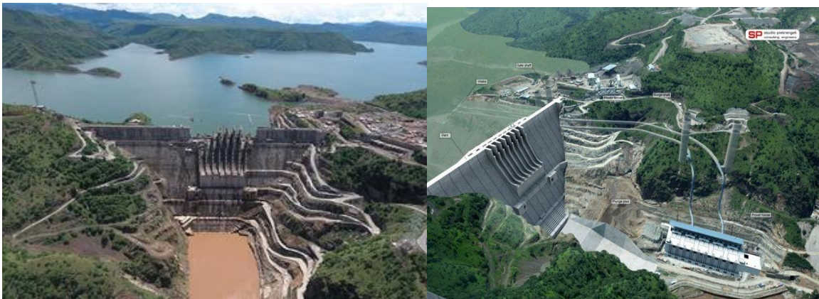
Figure 4.3.3: The Gibe III dam constructed on River Omo.

River Omo is an important watercourse that accounts for nearly 90% of inflow to Lake Turkana. The river forms a delta as it enters the lake and thereby creating critical fish habitats. Three dams for generating electricity had been built by Ethiopia on River Omo. Gibe III is the third biggest hydro-electric power plant in the region and has a capacity of nearly 1870 MW. 82 Moreover, Ethiopia has earmarked constructions of two more dams on River Omo.