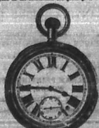
SEE SPECKLESS WATCH No. 51.