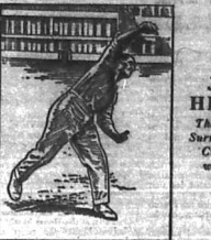
Illustration of a man in a suit, likely related to the Prince of Wales tour news.