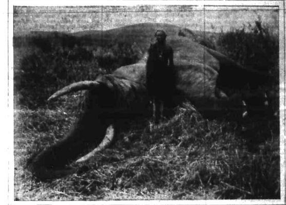
Our Newest Colony.