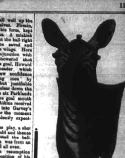
The Illustrations in our Booklets give an idea of the execution of our work etc.

W. J. Jeffery & Co. GUN AND RIFLE MAKERS, 15, KING ST. ST. JAMES, LONDON, W.O.