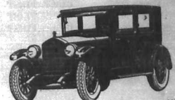
6 Cyl. ESSEX Coach with Five Tyres. Touring Cars with Five Tyres. Box Bodies with Five Tyres.