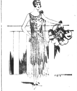
The latest evening model demonstrates the charm of dull gold ribbon, "fringe" falling to the ankles over a short hood of the black lace. Bristle ribbon, too, and the strappings which are attached to a little ribbon bracelet on the wrist.

Few steps make a useful blouse from a novel feature of which the narrow pleated suit at the back. Dotted and cut back to rest over the shoulders, which is used also to line the broad neck. Shoulders are a little too heavy. Falling straight from the top of the shoulder, line to the top of the bust, and straight up, which is a gain to be had. The same may be made of lace or gossamer or fringe or any light, shimmering fabric, rather than silk if it is the better to be used. Thus the designer who is endeavoring to make smooth the path of the middle-aged woman's dress has her remedy in the hope that they will be of assistance to those who may be a little weary sometimes as to the "sustainability" of modern dress.