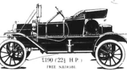
£190 (22) H.P. FREE NAIROBI.

These Horses do not die : : : of Horse Sickness.