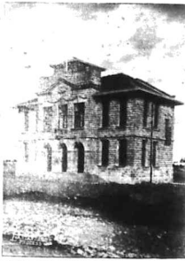
The Central Post Office, Nairobi, N. E. Africa.