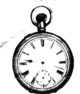
This watch is guaranteed to be accurate for 10 years.

PARKLANDS vs. Y. M. C. A. The match between the Parklands and Y. M. C. A. was played on Saturday last at the above ground and resulted in a victory for the Parklands by 10 to 0. The Parklands played a very strong game, and the Y. M. C. A. players were very satisfied with the result. The Parklands were very strong in the forward line, and the Y. M. C. A. players were very strong in the back line.