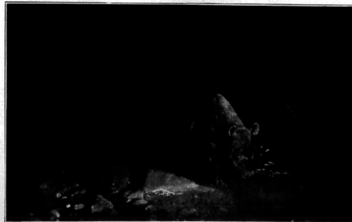
Two rhinos who photographed themselves by coming into contact with the thin wire visible in the picture.