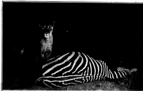
A fine lion study.