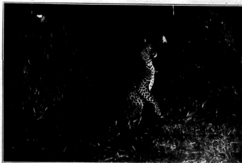
This leopard photographed himself by touching the bulb.