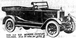
THE 1919 M.P. MORRIS-COWLEY TOURER. 35 H.P. 2500 cc. 100 miles or more per gallon of oil.