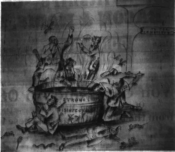
The Sanitation Commission after an inspection tour round Nairobi.