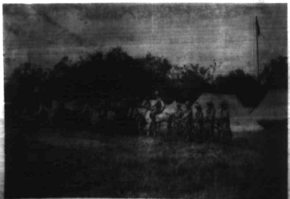
The Easter Camp of the B. E. A. Legion of Frontiersmen at the Mombasa.