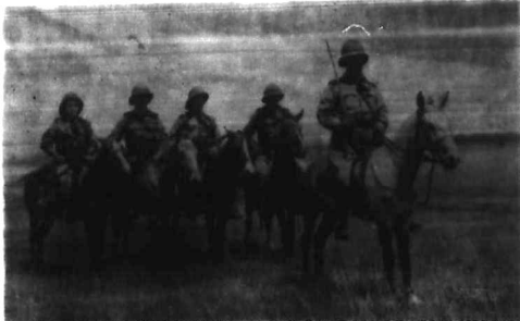
No. 1. Section of the E. A. Legion of Frontiersmen.