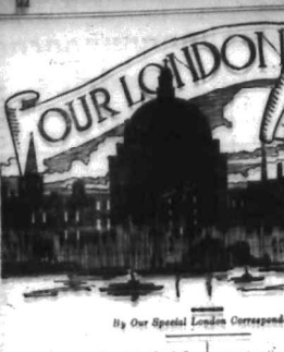
By Our Special London Correspondent