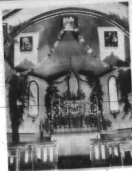
INTERIOR OF THE OLD CHURCH.