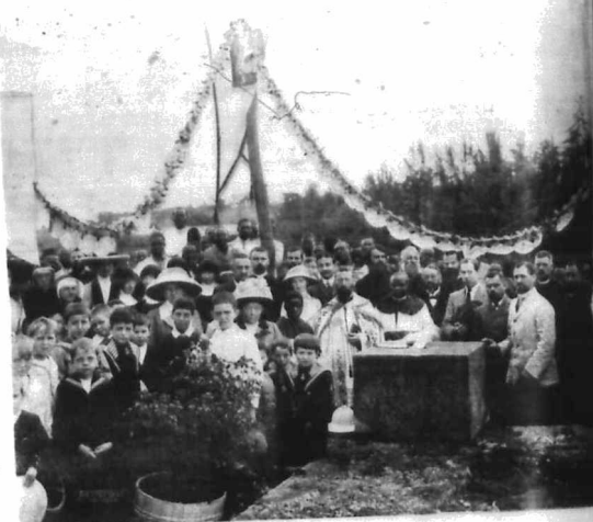
THE LAYING OF THE FOUNDATION STONE.