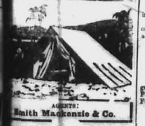
Smith Mackenzie & Co. Whistler Watches.