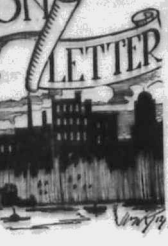
By Our Special London Correspondent