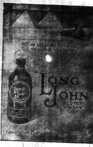
LONG JOHN SCOTCH WHISKY

FIELD GLASSES, LENSES, MICROSCOPES, LUBELS, PHOTODUPTS, REFRACTOMETERS. Large stocks in Stock. Action of Spectacles, Photo-Nets, PUNCTAL and UMERAL LENSES (white or tinted). ZEISS-IKON Cameras, Chromatop-Cameras and Projectors, existing by European Experts. An Amateur and Chromatograph Developing, Printing and Repair to all Cameras done in our Own Workshop. Expert Night Testing by fully qualified Opticians. Call and have your eyes tested with the most up-to-date Night-Viewing Apparatus FREE OF CHARGE.