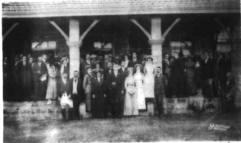
SCENES AT THE OPENING CERIMONY