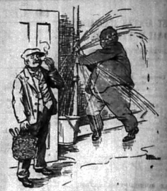
WATERPROOF! Plumber, naturally, it's good job you've trusted your boots this morning!

TERMS, RATES OF FREIGHT AND PASSAGE TO BE AGREED WITH. SMITH, MACKENZIE & CO. Agents.