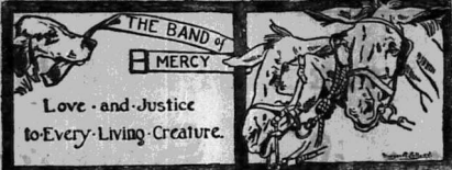
A column devoted to the interests of the Junior Branch of the E.A.F.C.A. Edited by the Hon. Secretary, Box 864, Nairobi.

P.O. Box 546, NAIROBI. OFFICE—1st Floor, Court Chambers. Financial Agents. Bills Discounted—Bills Bought— Any Realizable Asset Negotiated for Cash. Call or Write. STRICTEST CONFIDENCE. ESTABLISHED 1921.