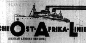
GERMAN AFRICAN SERVICE