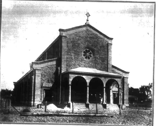
St. Peter's Church. The very fine new Catholic Church built principally for the native community in Nairobi.