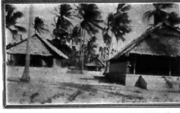
The children at Elton, Mombasa, and at the second Victoria Jubilee Camp and are also well provided for. A letter which will give a complete description of the camp.