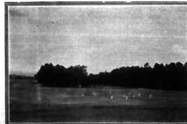
A view of a match between Kapsal and Nyeri on the latter's ground situated on the Nyeri road.