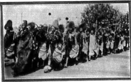
Dandi waiters in procession from