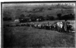
A sight of 64 men and 2 transport v. w. with bullocks, v. w. 115, photo.