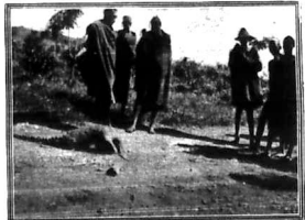
A People in an animal of the baboon species, which through widely distributed in Africa, was frequently seen.