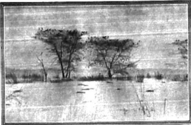
Crocodile in the water of Lake Rukwa, near the Victoria Falls.