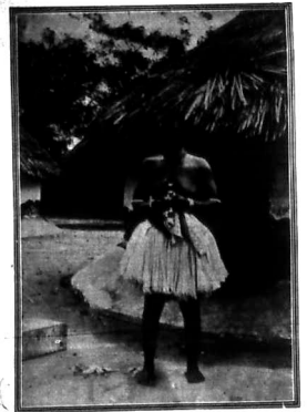
A Gipsy woman at Kulu, during the recent festival.