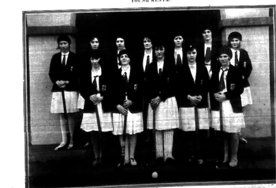
The ladies team of the Kenyan Government...