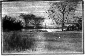
Crocodile on the bank of Lake Rukwa, near the Victoria Falls.