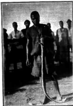
A Snake charmer with his snake, near the Victoria Falls.