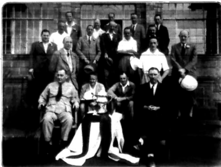
Photo that the Annual International Golf Match between England and Scotland was played on Monday, October 9, and finished in England scoring 10 to 11.