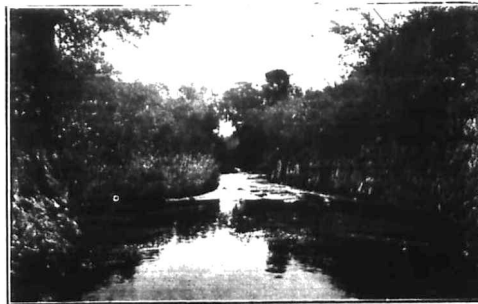
A Duck Revue in Darkest Africa