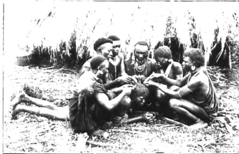
A Game of Chess