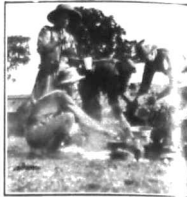
BREAKFAST IN CAMP