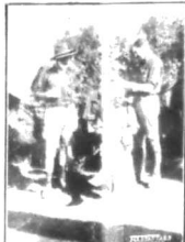
A CAMP SCENE