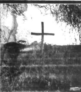
BOSS BURIED OVER THE GRAVE OF THE FIRST RHODESIAN KILLED IN ACTION DURING THIS WAR.