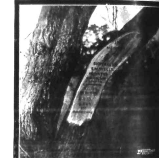
IN MEMORY OF RHODESIAN COMMANDERS WHO FELL FIGHTING FOR THEIR EMPIRE