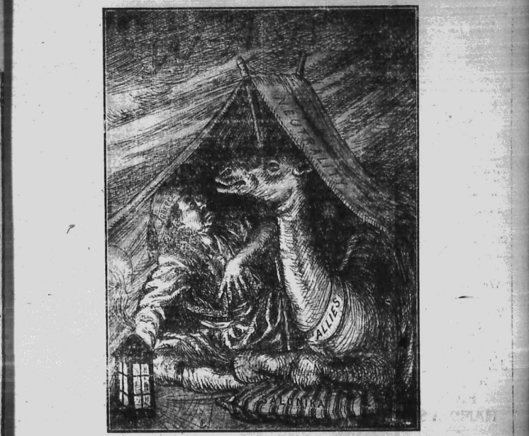
THE FABLE OF THE ARAB AND THE CAMEL. GREEK REVISED VERSION.