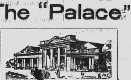
THE SUPER CINEMA