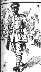
The British Soldier is used to having the best. His whole equipment, from his service cap down to his boots, is the best which the British Government can produce. So, too, when he buys Sunlight Soap...