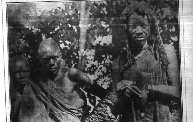
THE GREAT EX-MAGNIFIC OF KIJANGA.

THE BUILDS OF THE ROMAN CATHOLIC CHURCH, MOMBASA.