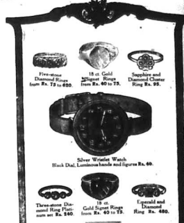
Black Dial Laminated Glass Case No. 40. Silver Watch Wrench. Gold Case No. 40. Gold Case No. 40. Gold Case No. 40.