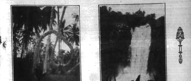
A QUAIN CONVEX TREE.