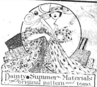
Dainty Summer Materials original pattern and tone.

This was the first correct solution opened out of several hundred replies. The mistake this time was grammatical. In advertising Air Pillow the word 'ensures' was used instead of 'insure'.