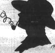
'Every puff a pleasure.'

The Rhodesian Smoking Mixture de Luxe in 1/4 lb. air tight tin. Re. 1-00 tin.