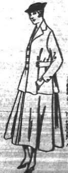
Ladies' Complete Outfitters.

Tailor made in the Finest Quality Pique. Wash perfectly from Rs. 47-50 each.