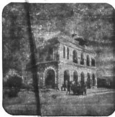
MacJOHN & Co., Proprietors.

MACKINNON BROTHERS, General Merchants, NAIROBI.