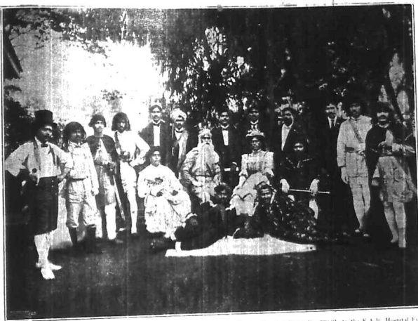
Some of the Theatre Royal performers who gave a splendid performance at the Theatre Royal, and sent for 300-01 to the S.A.R. Hospital Fund.