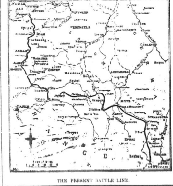
THE PRESENT BATTLE LINE.