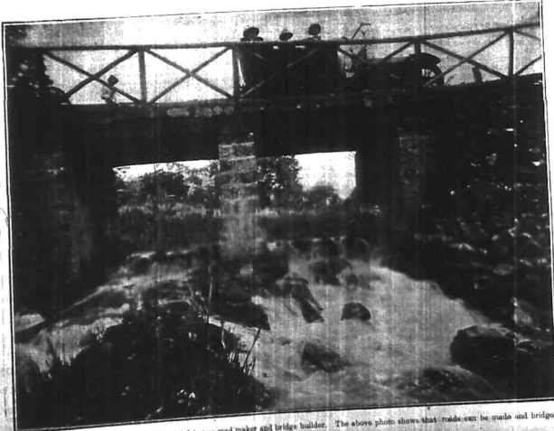
The great and popular Mr. Silvester makes a successful debut as road maker and bridge builder. The above photo shows that roads can be made and bridges built in East Africa.

country like ours. Incidentally it cannot be denied that the same has rendered valuable service in giving all and sundry the opportunity of settling their views on a burning question. To be perfectly frank, it is not agree with many of the opinions that have been expressed, but at the same time we have not forgotten that the opinions we have advanced are those of a private citizen, and we have no right to expect that the public should be bound by our views. It is for the public to decide whether or not they wish to adopt the proposals, and it is for the public to decide whether or not they wish to accept the proposals, and it is for the public to decide whether or not they wish to accept the proposals.