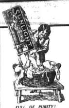
FULL OF PURITY!