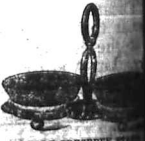
DOUBLE PRESERVE STAND with glass dishes. Rs. 25-75 complete.