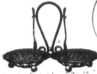
Electro-Silver Shell Preserve Stand. Rs. 38-75 complete with spoons.