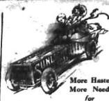
More Haste More Need for

Give us a call and you will be satisfied.