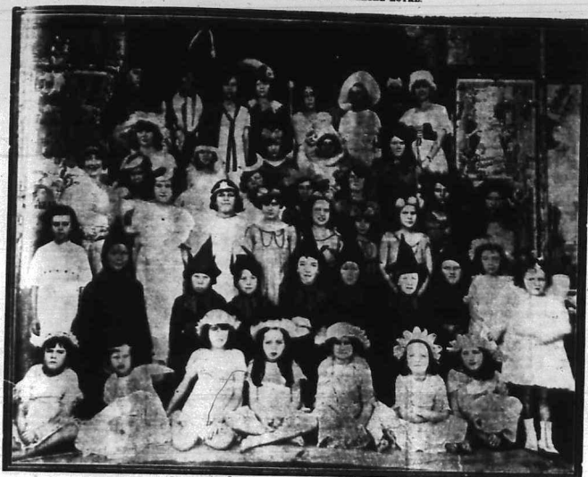
THE PERFORMERS IN FULL DRESS.

CHILDREN'S PANTOMIME AT THE THEATRE ROYAL.