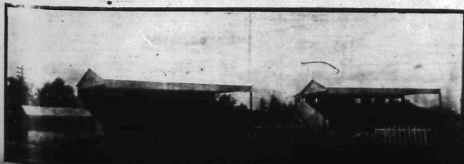
NAIROBI RACE COURSE.