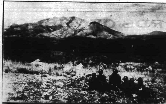
A VIEW OF MOUNT KENIA IN THE HURU DISTRICT.