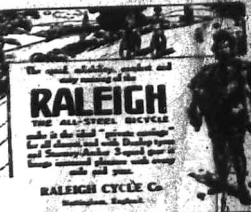
The most complete and best ...