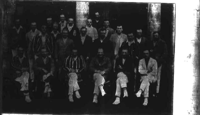
THE TWO TEAMS WHICH TOOK PART IN THE ANNUAL MATCH WON THIS YEAR BY THE OFFICIALS