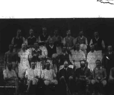
WINNERS OF THE CUP