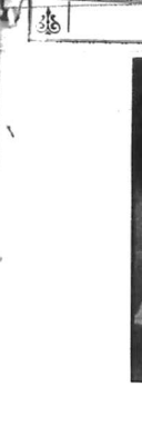
standing in front of the G.I.G.O. stock sale...