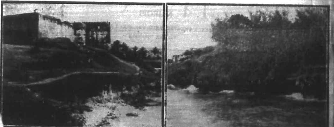
THE OLD MOSE.