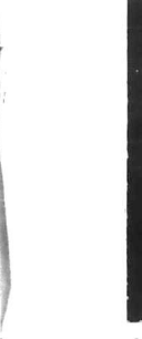
standing in front of the G.I.G.O. stock sale...