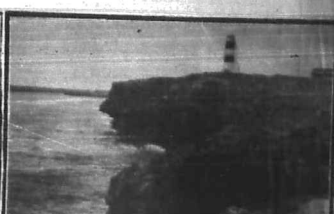
OUT TO SEA.