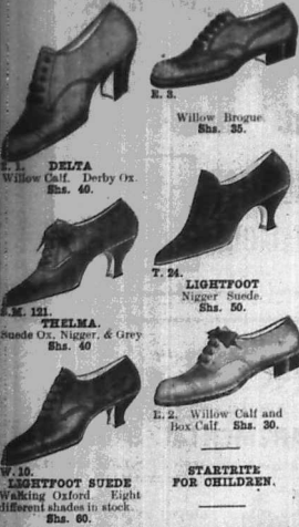
DELTA Willow calf. Derby ox. Shs. 40.