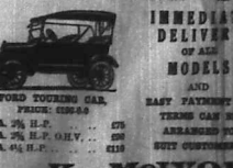
Image of a Ford motor car.