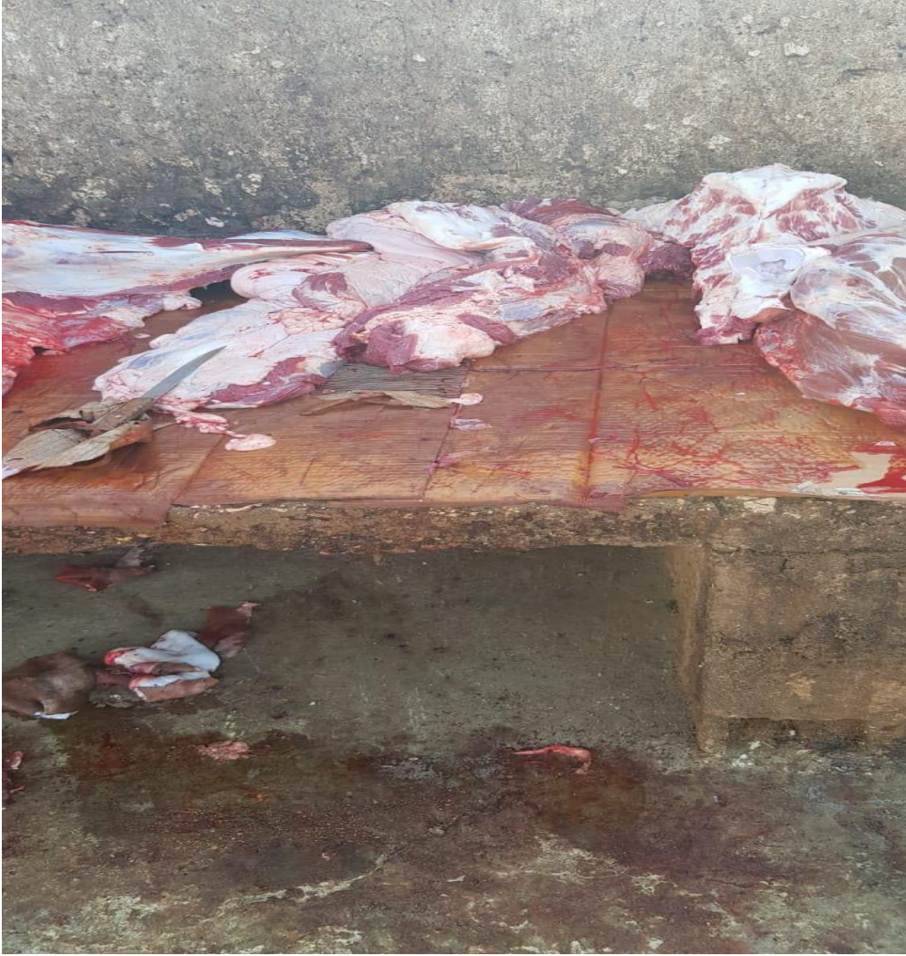
B). Meat on a slaughter slab in Bosaso