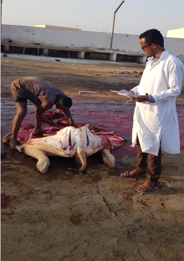
C). Researcher collecting data from a camel Slaughterhouse worker in Bosaso