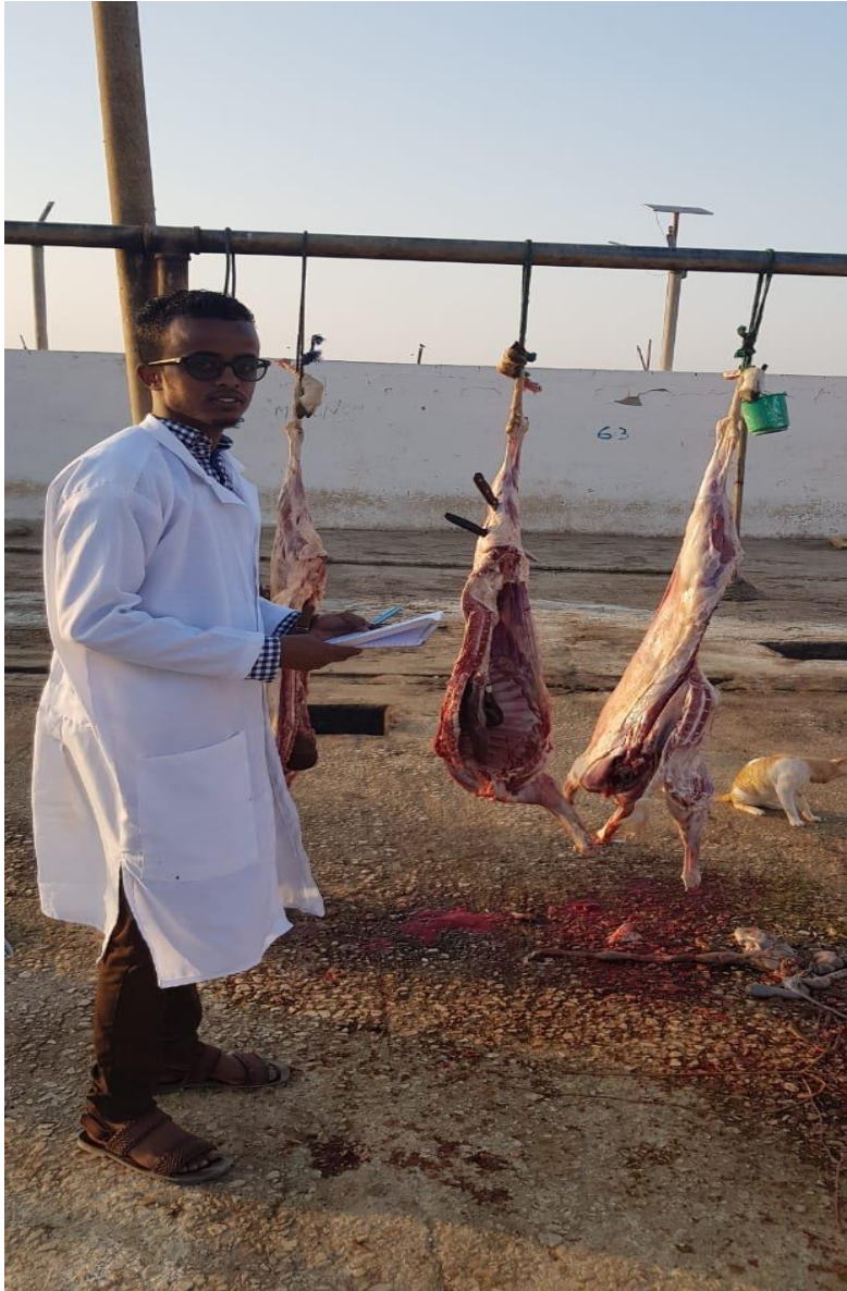
A).The researcher collecting data at a slaughter slab in Bosaso