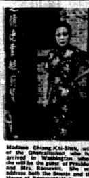
Madame Chiang Kai-shek, wife of the Chinese Premier, who will be the guest of President and Mrs. Roosevelt, will address both the Senate and the House of Representatives.

"Admiral Missing" "The Admiralty has announced that the whereabouts of the Admiral are still unknown..."