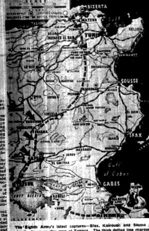
The Eighth Army's latest captures—Kairouan and Soussa are clearly shown on this map of Tunisia. The thick dotted line represents the battle front of a few weeks ago. It is now completely out of date.