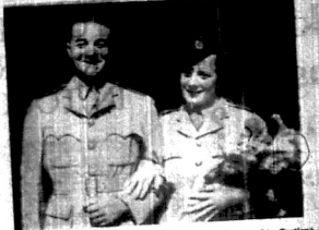
of a family from the East African Standard office.

GAILEY & ROBERTS LTD. BRANCHES THROUGHOUT EAST AFRICA